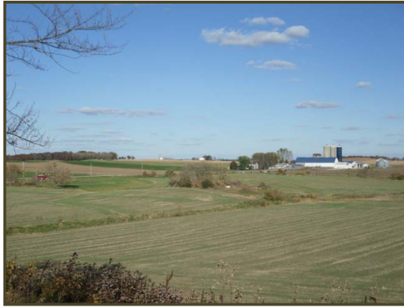
View Northeast from Lake Marie Cemetery Toward Views A,D, & E