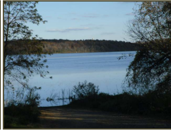
View East Lake Maria