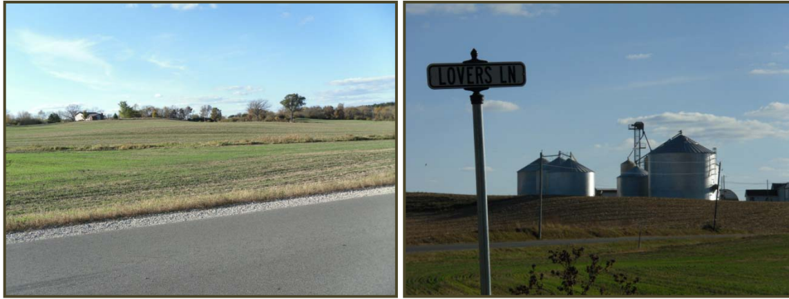
GROUP C: View Northwest & South (Rufus Land Patent 1848, Sold 1864)