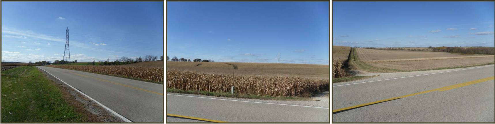
GROUP F: View North from West to East (Rufus R purchased 1864, Catherine sold 1882)