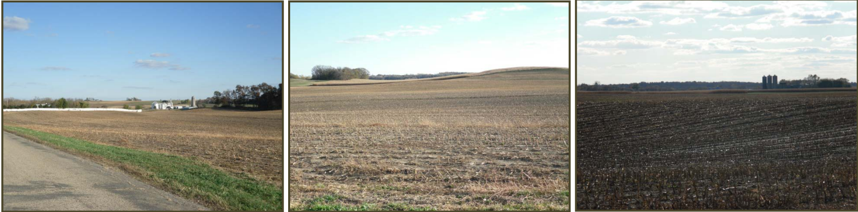
GROUP D: View to South from East to West (Mariah Langdon Patent 1848, Rufus R purchased from 1855)