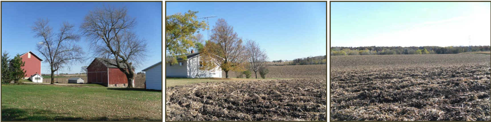
GROUP F: View South from East to West