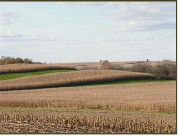
GROUP E: View North