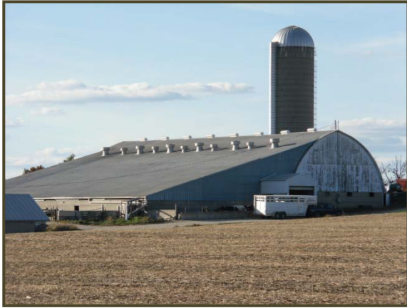
GROUP D: View West and Northwest