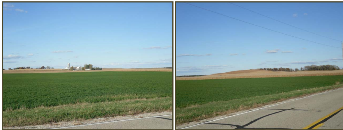
GROUP B: View to North - Northeast