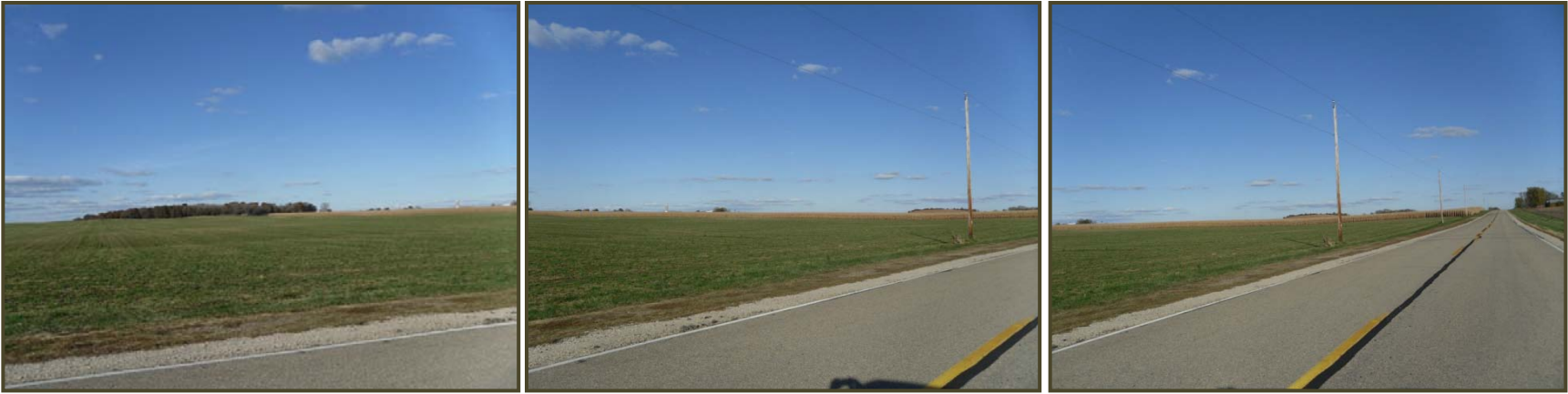
GROUP A: View to North - Northeast